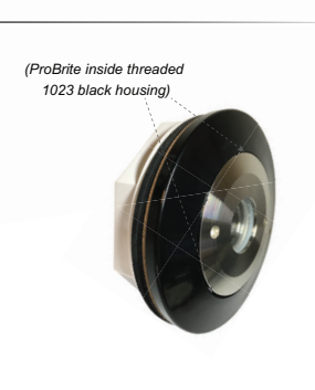
Fits 1023 (shown) and 1.5" F.I.P.